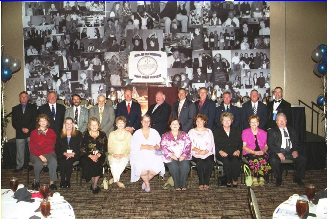
(Representing 25 years of leadership above are 21 out of 25 NCPMA past presidents)

A highlight of our 25 th Anniversary was the reunion of our past presidents. Who says you can't be NCPMA President and live to tell about it? YOU GUYS ROCK!!!